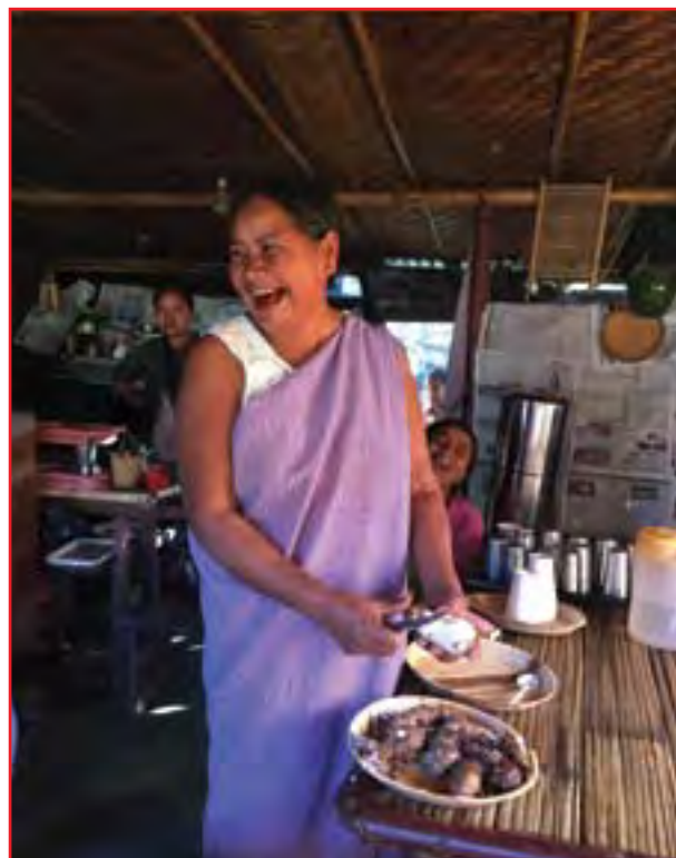
Chef of community-owned business in tribal area of Northeast India that works with the North East Slow Food and Agrobiodiversity Society (NESFAS).

The Thread Fund discussed a recent experience from the Cascadia Foodshed Financing Project 10 that illustrates the divide. The Project hired Ecotrust to identify market drivers and investment opportunities in the Pacific Northwest for six sustainably produced products. When presented with the report, grant makers and investors—based in the same region and presented with the same information—had different conclusions about how to proceed. “Foundations tend to fund for transformational system change, while for-profit investors seek to ‘pick winners’ based on