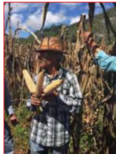
Farmer engaged with CEDICAM (Centro de Desarrollo Integral Campesino de la Mixteca), Oaxaca, Mexico.