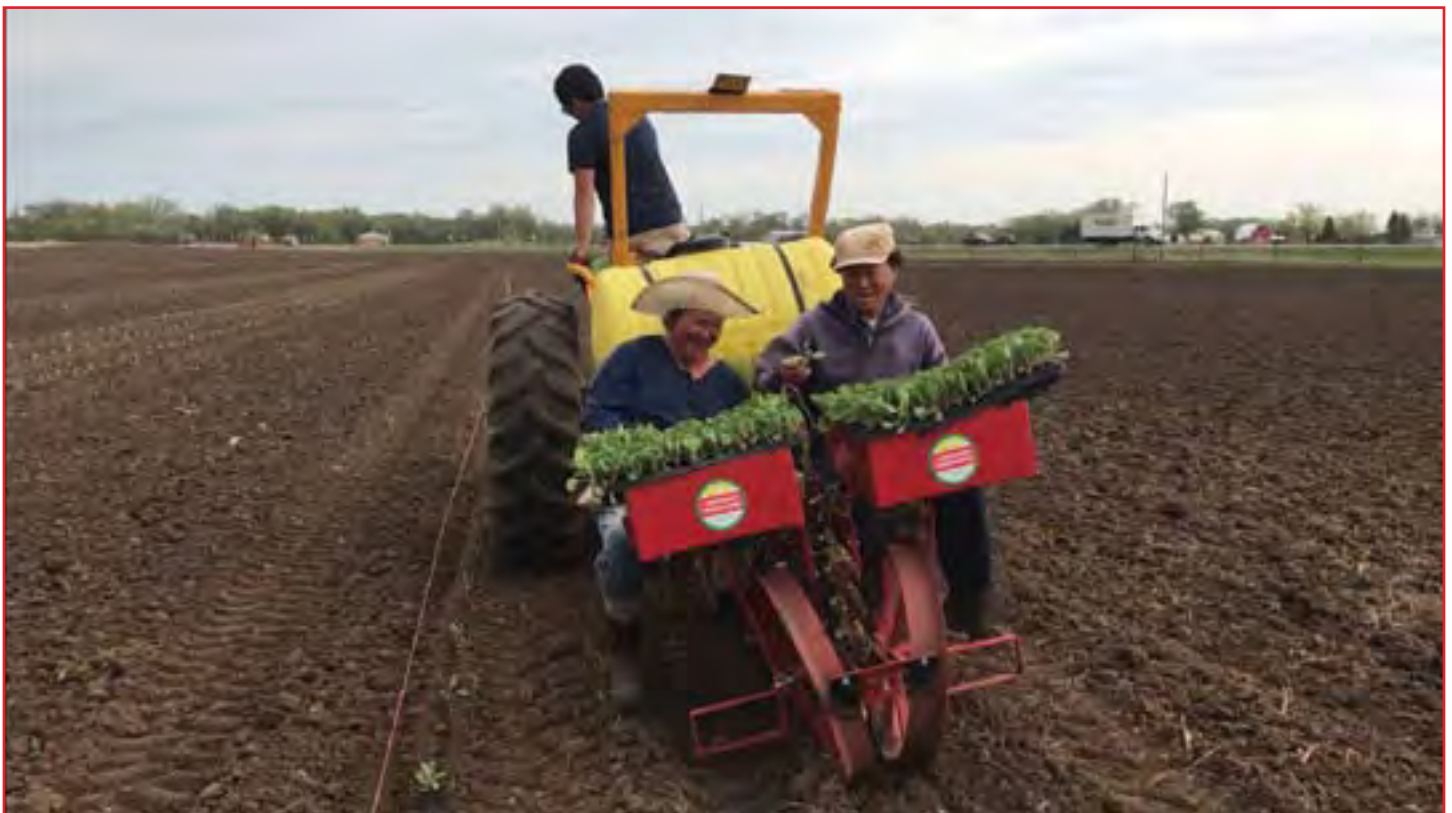
Hmong-American Farmers Association. Investors have helped the HAFA provide the full set of services its farmers need to succeed, including training, technical expertise, farmland and infrastructure.